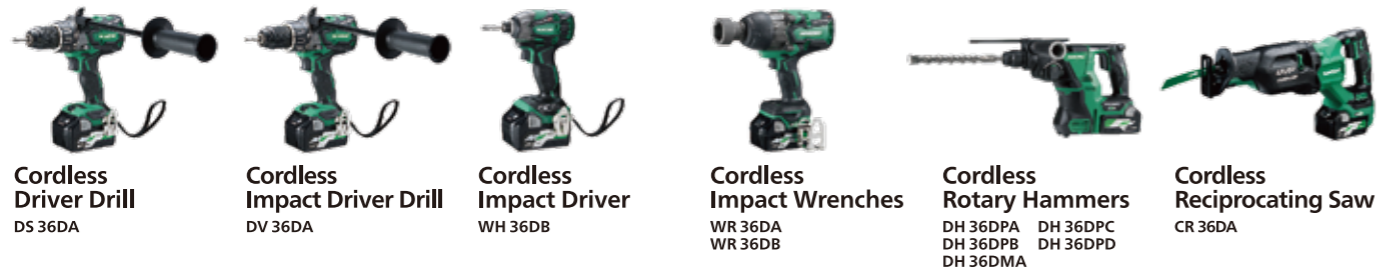
Cordless Driver Drill DS 36DA Cordless Impact Driver Drill DV 36DA Cordless Impact Driver WH 36DB Cordless Impact Wrenches WR 36DA, WR 36DB Cordless Rotary Hammers DH 36DPA, DH 36DPC, DH 36DPB, DH 36DPD, DH 36DMA Cordless Reciprocating Saw CR 36DA