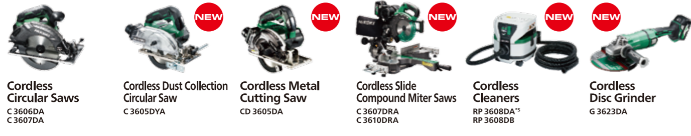
Cordless Circular Saws C 3606DA, C 3607DA Cordless Dust Collection Circular Saw C 3605DYA Cordless Metal Cutting Saw CD 3605DA Cordless Slide Compound Miter Saws C 3607DRA, C 3610DRA Cordless Cleaners RP 3608DA*5, RP 3608DB Cordless Disc Grinder G 3623DA