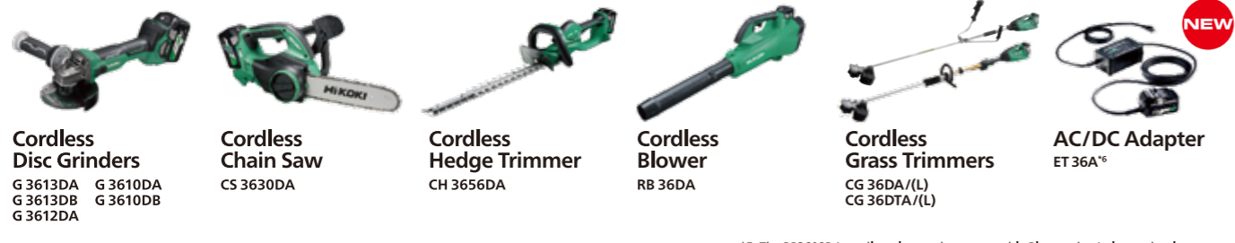
Cordless Disc Grinders G 3613DA, G 3610DA, G 3613DB, G 3610DB, G 3612DA Cordless Chain Saw CS 3630DA Cordless Hedge Trimmer CH 3656DA Cordless Blower RB 36DA Cordless Grass Trimmers CG 36DA/(L), CG 36DTA/(L) AC/DC Adapter ET 36A*6

*5. The RP3608DA cordless cleaner does not enable Bluetooth wireless technology. *6. The performance of the brake function for the 36V MULTI VOLT cordless disc grinders varies by power source. Also, full performance for the G3623DA cordless disc grinder is not possible using the ET36A.