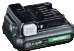
BSL 1225M 12V PEAK 2.5Ah