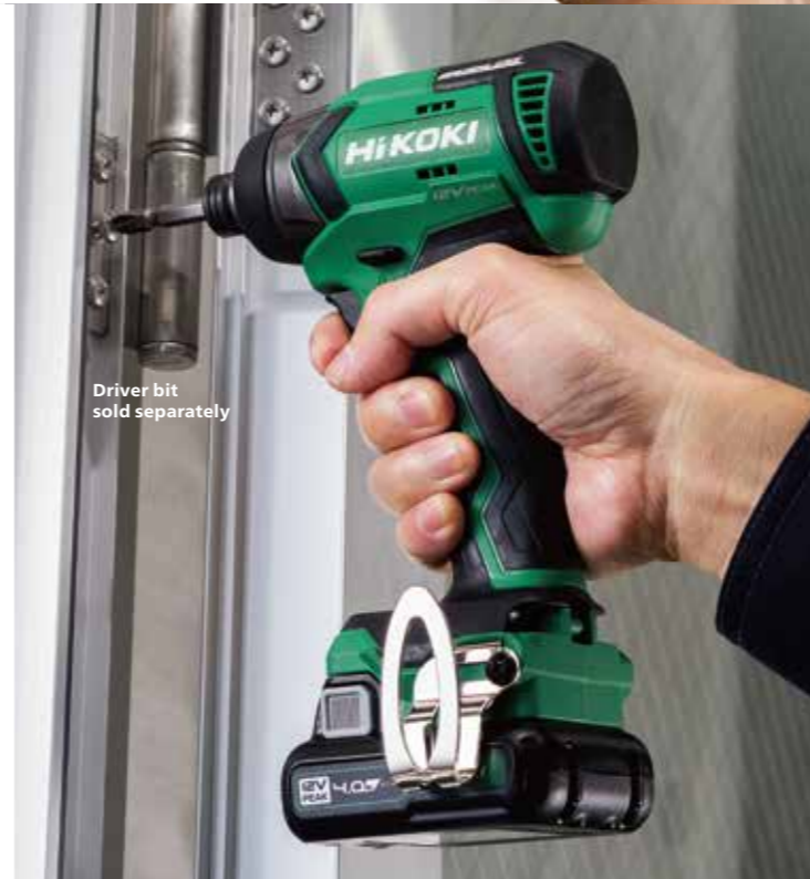
Cordless Impact Driver WH 12DD