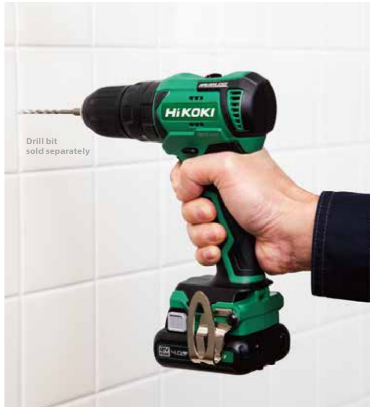
Cordless Impact Driver Drill DV 12DD