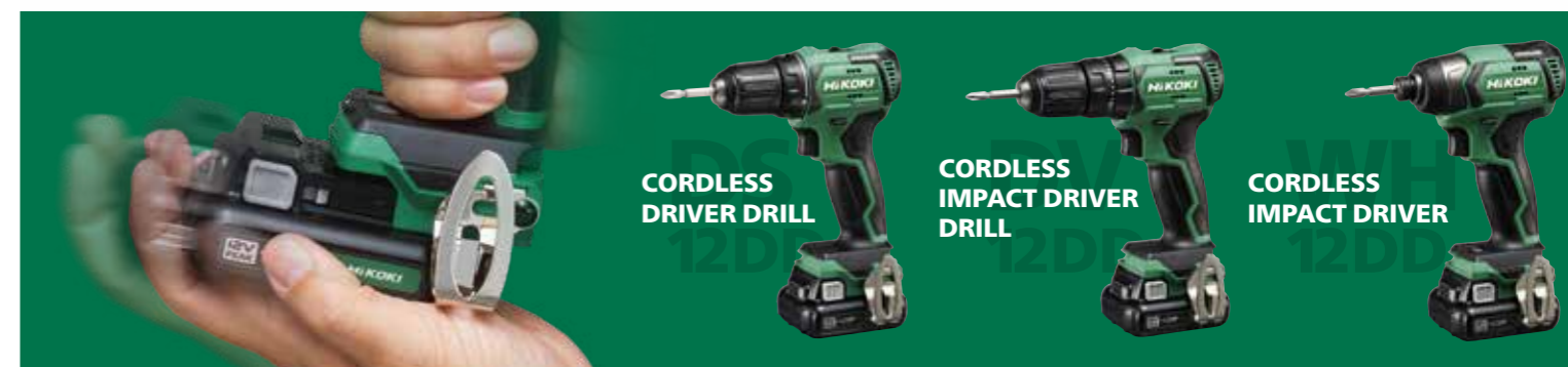
CORDLESS DRIVER DRILL

* As of November 2018, among 10.8V cordless driver drills, impact driver drills and impact drivers made by leading power tool manufacturers. (Survey by Koki Holdings)