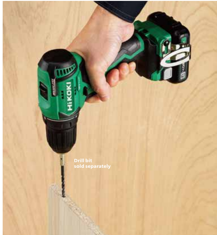
Cordless Driver Drill DS 12DD