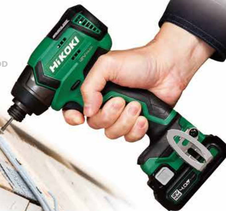
WH 12DD Shown with optional driver bit