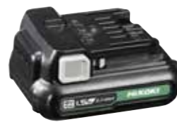
BSL 1215 12V PEAK 1.5Ah