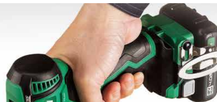
DS 12DD Shown with optional drill bit

Versatile and Compact with the Shortest* Head in its Class