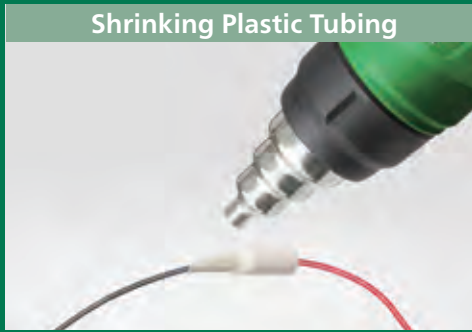
Shrinking Plastic Tubing